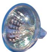
3x1W OSP LED

MR16 halogen LED MR16 Cluster LED 3W CREE