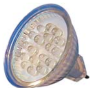
MR16 LED RGB